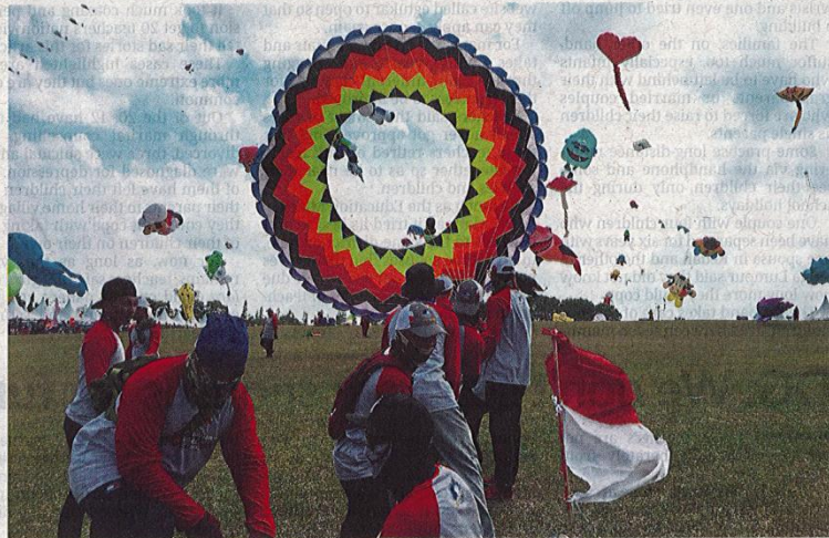
Colourful event: Kites of various shapes and colours flying at the 24th Pasir Gudang World Kite Festival 2019.

"This year's theme is 'The Beauty of Culture', showing traditional kites from all over the world," he said.