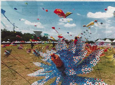
Kites of all shapes take to the air, flying over a garden of flowers.

This year's event attracted kite flyers from 45 countries, including Colombia, United Arab Emirates, Bulgaria, Hungary and Venezuela.