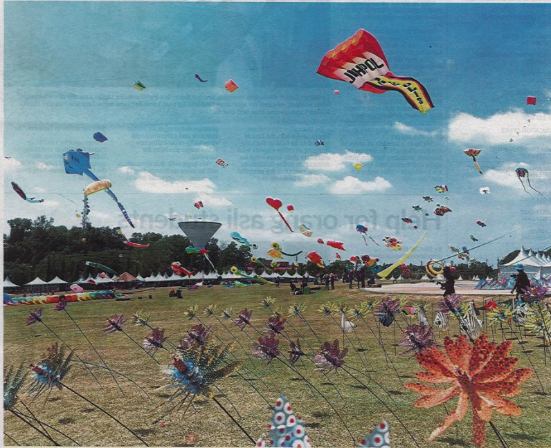
Breathtaking sight: Dozens of kites take to the air at the 24th edition of the Pasir Gudang World Kite Festival 2019. In the foreground, multi-coloured flowers made from a variety of materials dot the field.

Kites of all shapes and sizes swarm the skies over Pasir Gudang during the annual World Kite Festival, which attracted 300,000 visitors. >3